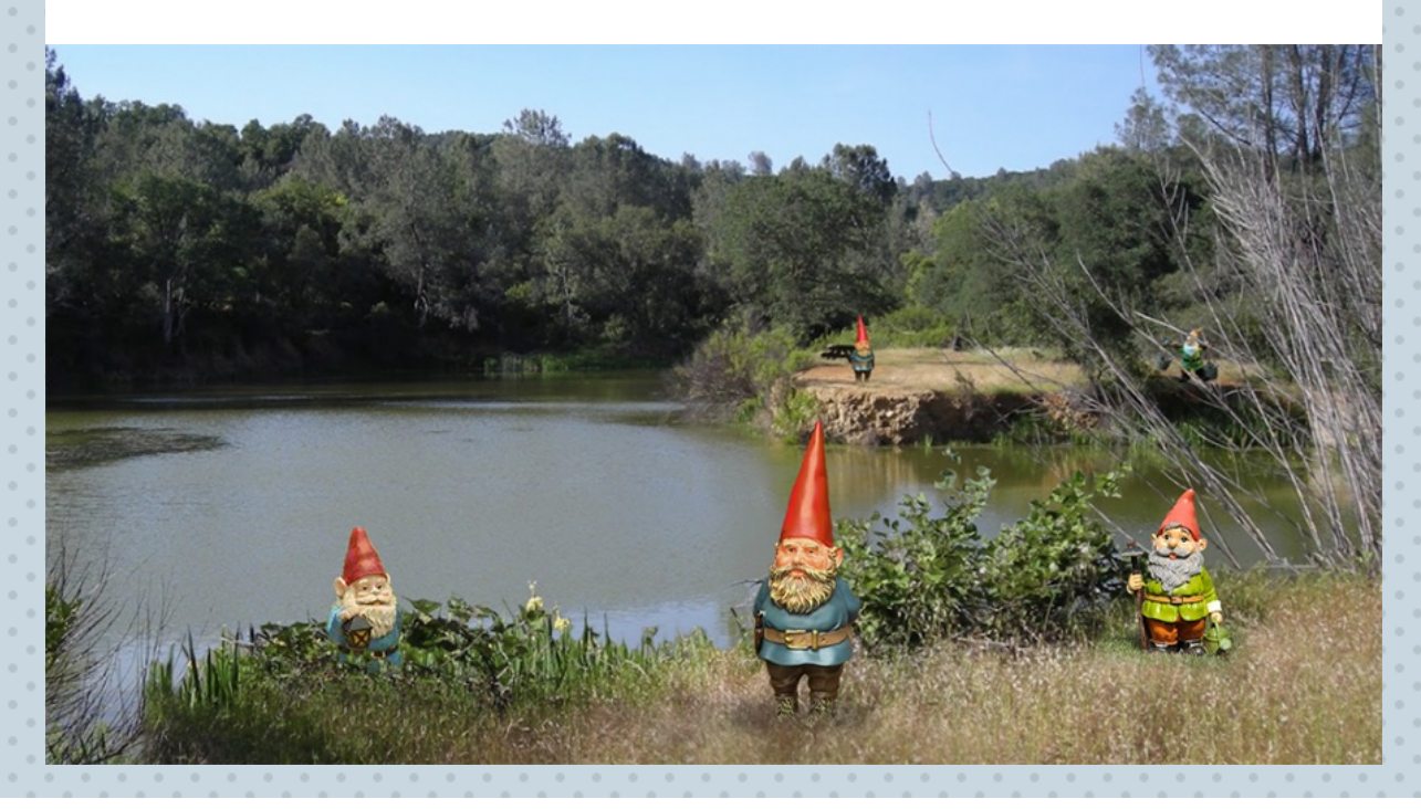
Fit 2 Run, Inc. (NorCalUltras & RYP Wear) | 601 Commerce Drive Suite #100 | Roseville, CA 95678 US