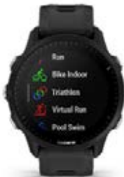
Forerunner 255 Music