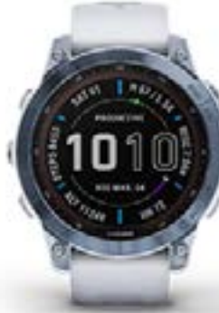
Fenix 7 Series