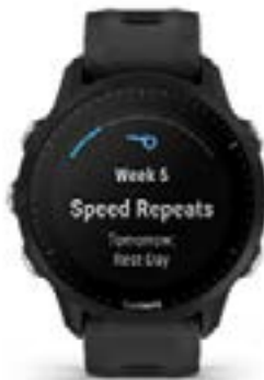
Forerunner 955/955 Solar